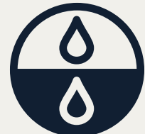
Water and waste systems