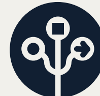
Control and communication systems