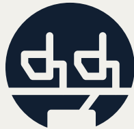
Vacuum toilet Central System