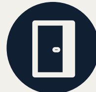
Cabin door systems